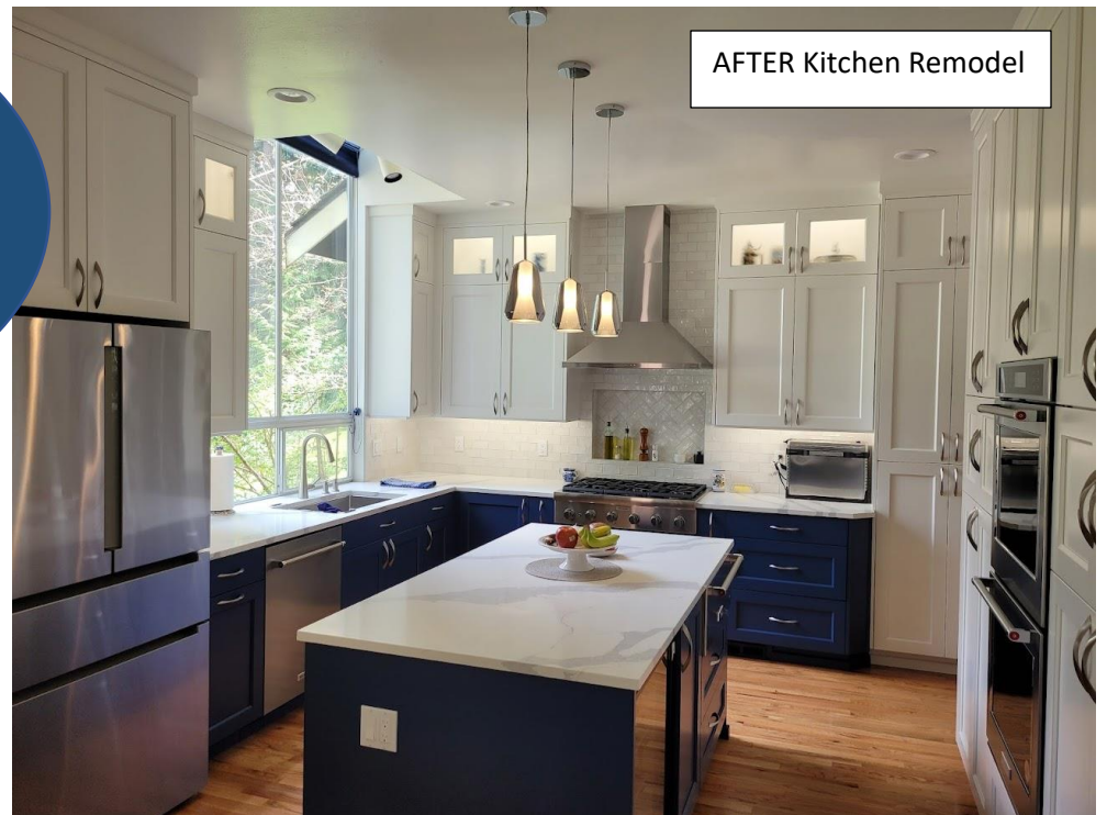
AFTER Kitchen Remodel

Kitchen islands work well for circulation and multiple users in the kitchen. To avoid shoe-horning in this center piece, allow 42" to 48" for two people to comfortably pass. If space is too tight, a peninsula may work best.